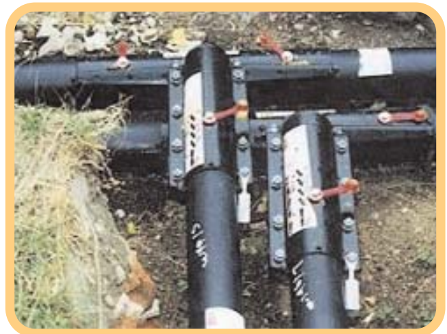
Figure 2: Underground pipes for community heating mains

Hot water enters the building through underground pipes and is then pumped to each flat. The flats have conventional hot water radiators with thermostats and time controls which are fed direct from the system. Domestic hot water is produced using heat exchangers. Each flat has its own heat meter so that occupants pay only for the heat they use.