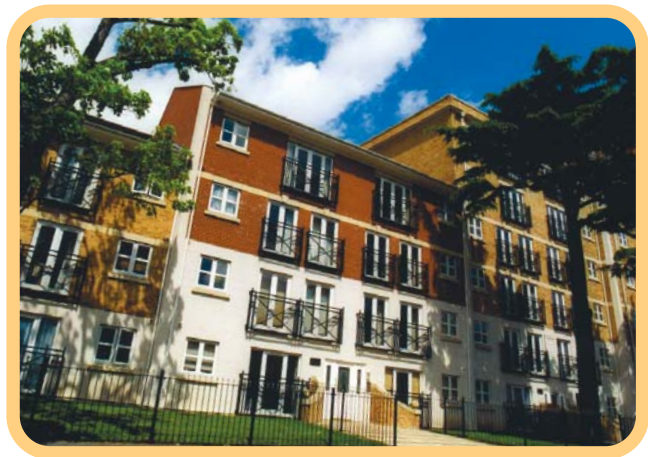
Figure 1: The ParkView development

The Southampton District Energy Scheme is linked to a combined heat and power (CHP) generator which is very efficient at providing heat. As a result of its connection to this, the ParkView development received a Bronze Award in the Best Energy Saving Development category of What House? magazine's '2001 What House? Awards'.